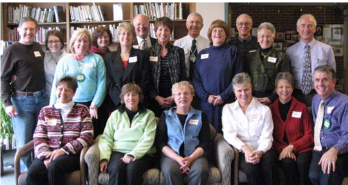
Gathering of past Deans still involved with camp