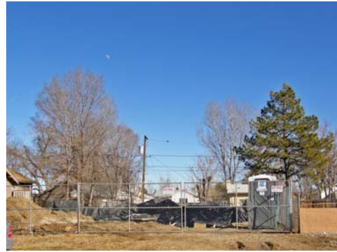
54 Hazel Court (west of Federal & north of Alameda)