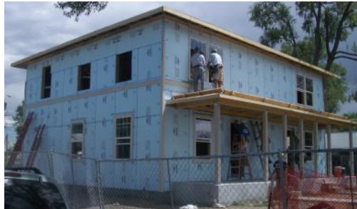
Putting in the windows on August 11

If you can spend a day as a volunteer, call Bruce Thumm at 303-905-2225. If you can help us cover the construction costs, contact Arlene Hutchinson at 303-756-4367 or Stan Harwood at 303-770-3387. Thanks for all you've done and continue to do!