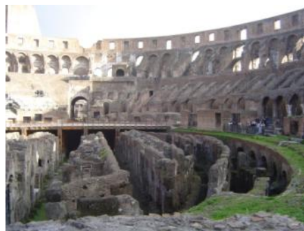
An Amphitheater in Pompeii