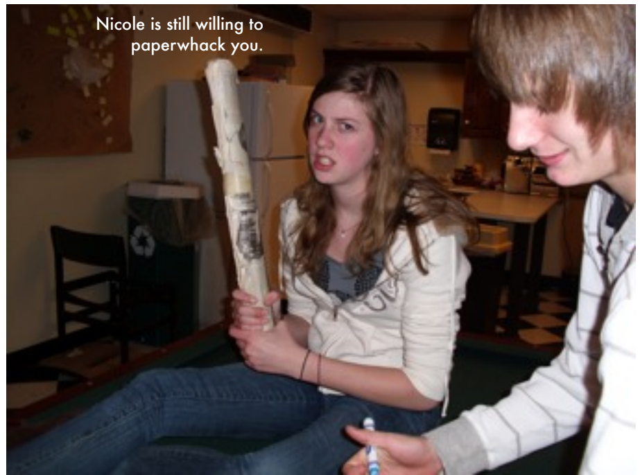
Nicole is still willing to paperhack you.