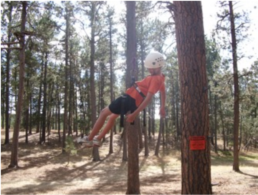
See? Same photos.