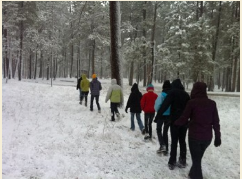
The 2011 Confirmation class, in the snow at La Foret.

I, for one, am pleased to have the opportunity to watch it all unfold. It's fun to be around long enough to see someone as a middle schooler, unsure of herself, and then as a high schooler, confident and outgoing. Or, it's fun to be around long enough to see the high